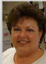
IMMEDIATE PAST PRESIDENT PRESIDENT