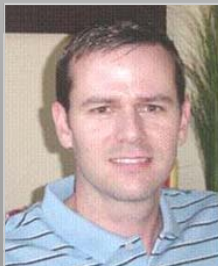
VICE PRESIDENT AUDIOLOGY & HEARING SERVICES