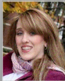
VICE PRESIDENT CONTINUING EDUCATION