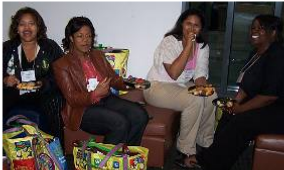
ArkSHA Attendees Enjoy the Reception