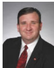
Senator Shane Broadway